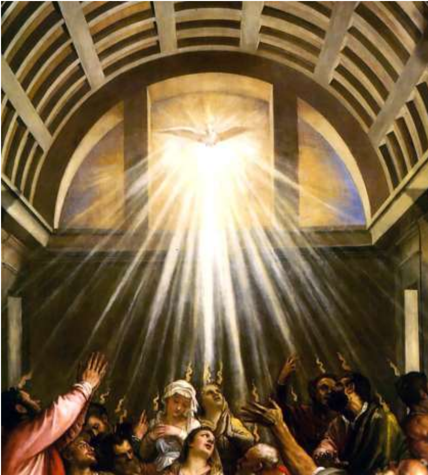
Pentecost , 1545 by Titian, approx. 1488-1576; Santa Maria della Salute, Venice, Italy.