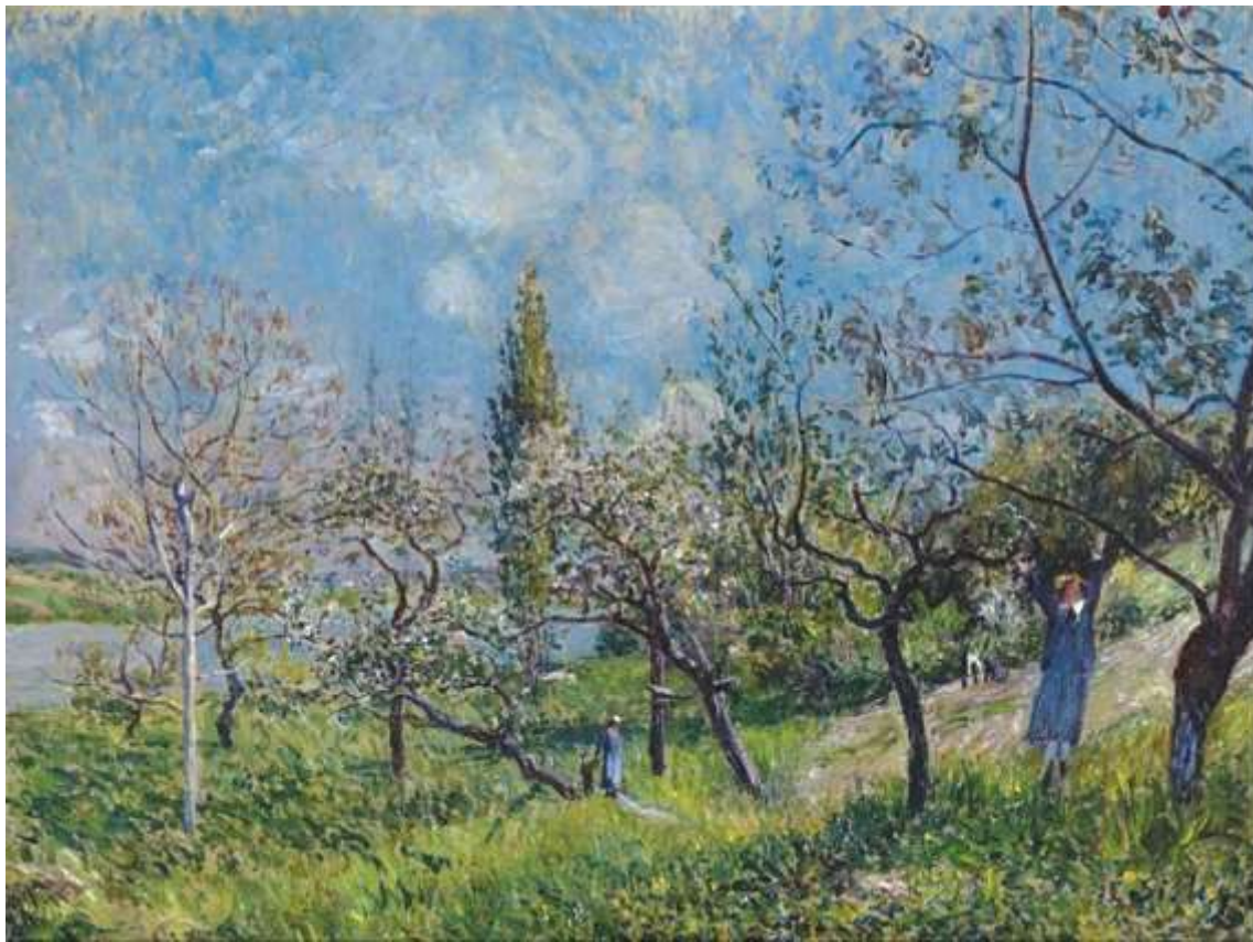
Orchard in Spring , 1881. Sisley, Alfred, 1839-1899. Museum Boijmans Van Beuningen, Rotterdam, Netherlands.