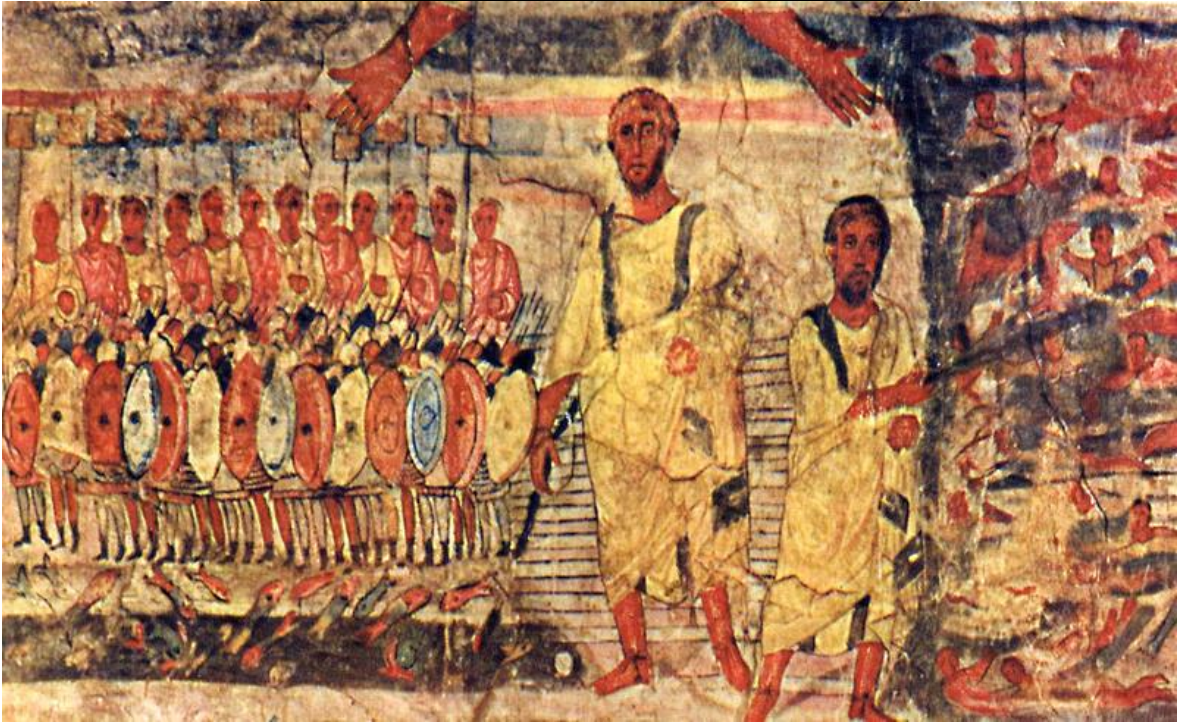
Crossing the Red Sea, Dura-Europos House Church, Syria.

"Dura-Europos church (also known as the Dura-Europos house church) is the earliest identified Christian house church. It is located in Dura-Europos in Syria. It is one of the earliest known Christian churches, and was apparently a normal domestic house converted for worship some time between 233 and 256, when the town was abandoned after conquest by the Persians." [from Wikimedia]