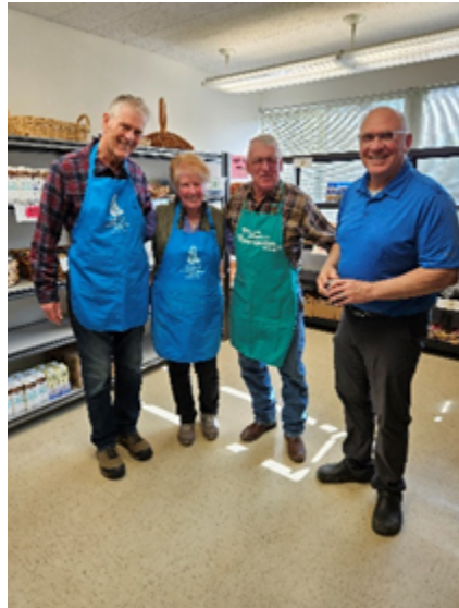
Tuesday Food Pantry Crew