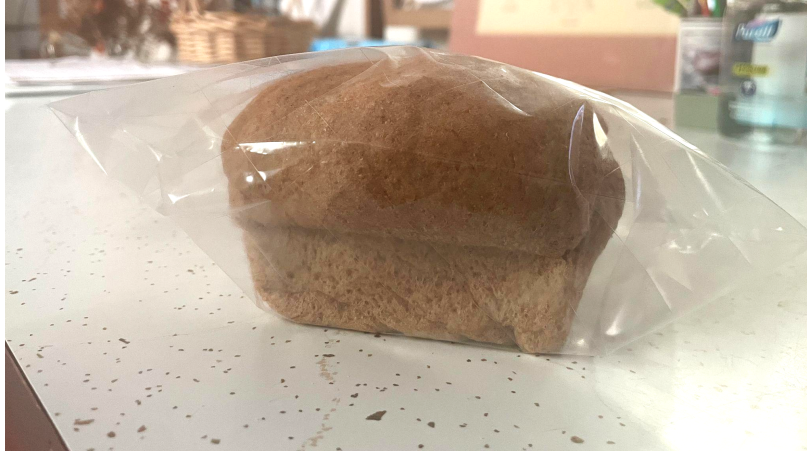
New bread for communion, baked by Pete Ruppel