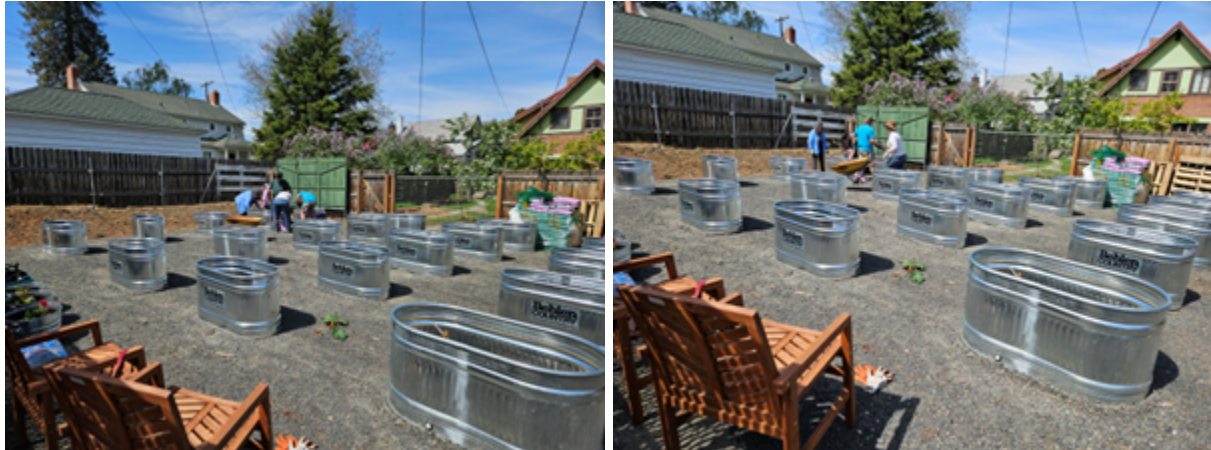
Getting new raised beds set up.

Thanks to garden workers on a sunny spring day. Ready to plant in May.