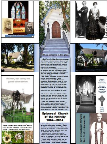
History poster 9 29 15